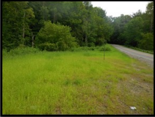
Disturbed site being hydroseeded.