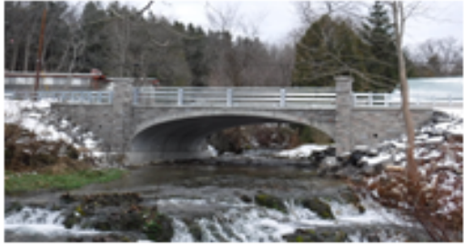
Wiltse Hill Road, CR 95 BIN 377 1950 - Hamlet of Van Homesville, Town of Stark