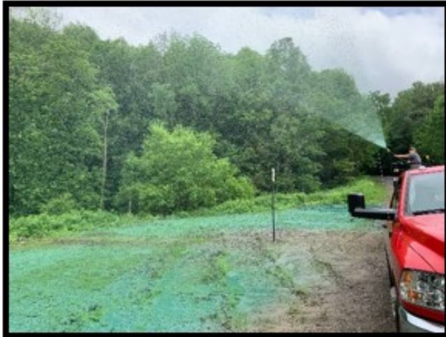
Disturbed site being hydroseeded.

Only municipal-owned roadsides and rights-of-way are eligible for this service. For additional information, or to schedule a time to meet and discuss your seeding sites, please call the District at (315)-866-2520 ext. 5. You can also email our Conservation Aide, Bob, at robert.tilbe@ny.nacdnet.net .