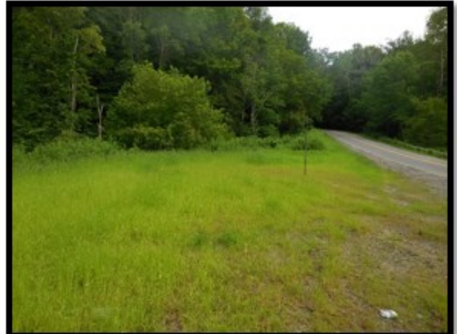
Site four weeks after being hydroseeded.